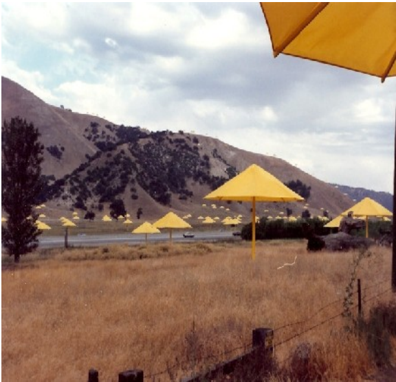
Umbrellas along Interstate 5