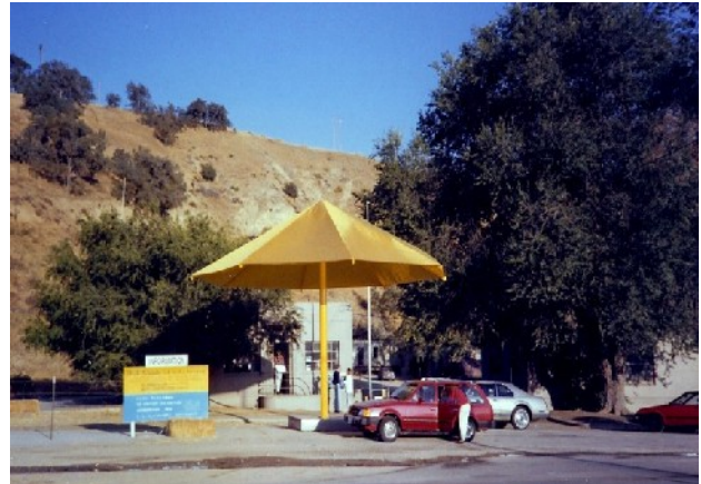
The old Gas Company building, later the post office, served as the Christo headquarters in Lebec.