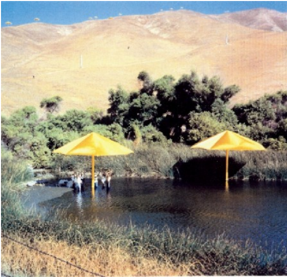
Crews unfold umbrella for Christo exhibit in sag pond along Gorman Post Road.