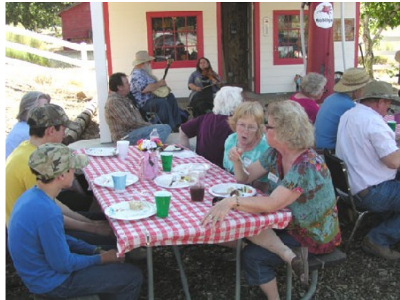
2010 Community Picnic

Coming Events – Our next event is the Community Picnic on July 16 at the museum. We will gather at 5:00 p.m. This is a potluck supper with hot dogs and hamburgers provided as well as lemonade and ice tea. Bring your own special side dish or desert to share. We are planning a program and music and you can browse the museum and try some of the interactive displays. Bring your own chairs . We have very little ability to seat groups. Members of the staff of the Three Falls Boy Scout Camp will be joining us to do their impersonations of local historic characters, Ron Edsall will entertain with old time music and there will also be a display by Route 66 Gold Diggers.