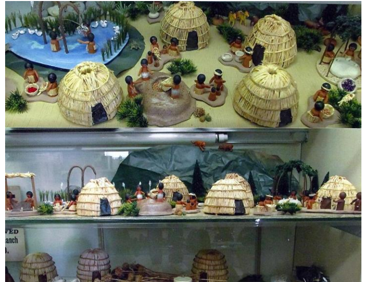
Diorama by Lynda Finch

Lynda Finch of the Kern County Genealogy Society created a wonderful 175 piece diorama of the mountain Chumash people (shown right) that was on display at the Beale Library in Bakersfield. The depictions were based on Susan Sjoberg's illustrations in Volume 1 of Bonnie Kane's series of