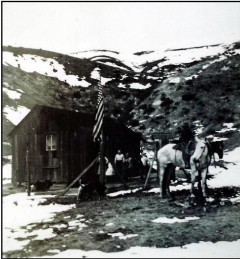
Horses waiting to take children home outside the first Gorman School