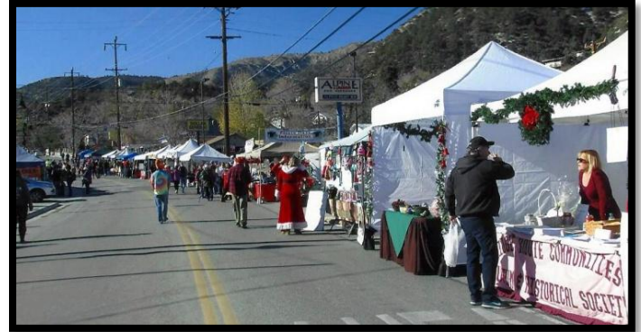
Museum booth (right) along Mt. Pinos Way at the December Holiday Faire in Frazier Park