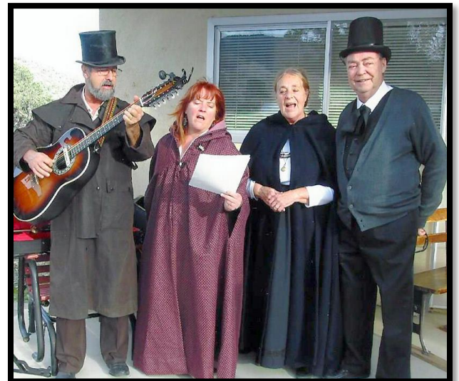
Carolers at the Dickens Christmas Tea