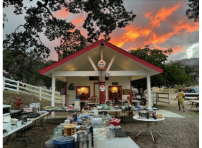
Sunset at the Museum the night before the sale

Thank you to everyone who both donated the many wonderful items and those who purchased those items at our annual Great American Yard Sale. And while it did sprinkle both the night before, and again the next day, this year's event was another smashing success, bringing in over $7,300 and allowing us to ensure that we have our annual insurance paid in full (plus a few other things).