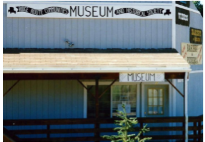
The First Museum in Lake of the Wood