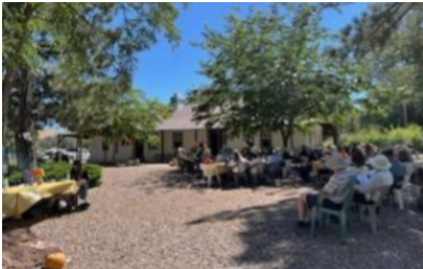
Destination Lunch at Liebre Adobe