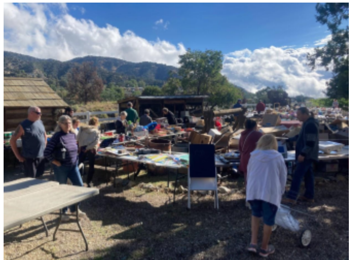
Opening Day of the Yard Sale

Thank you to everyone who both donated the many wonderful items and those who purchased those items at our annual Great American Yard Sale. And while it did sprinkle both the night before, and again the next day, this year's event was another smashing success, bringing in over $7,300 and allowing us to ensure that we have our annual insurance paid in full (plus a few other things).