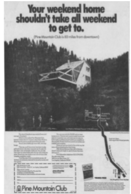
The Los Angeles Times - June 1, 1973

In 1971 Tenneco West started lot sales, and by mid-1971 almost 250 homes had been built. By 1973, after selling out the first five sections and doing more than $15 million dollars in land sales, they opened the sixth and final section of Pine Mountain Club.