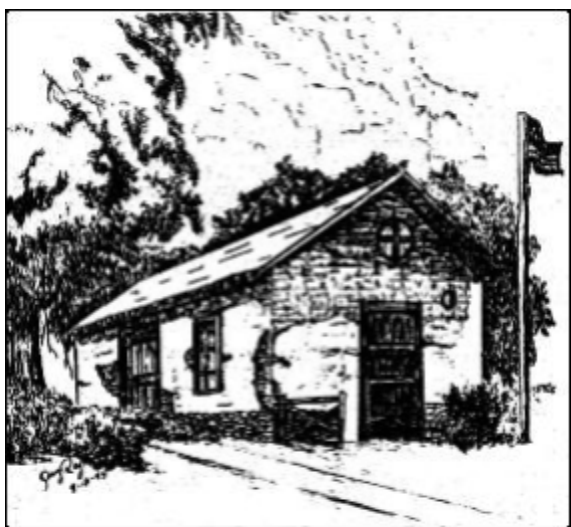
Adobe post office at Fort Tejon