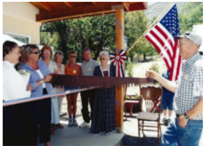
2003 Opening ceremonies of the current museum

In 2003 Bonnie purchased the museum's current property outright. We then purchased it from her on a 20-year mortgage. In 2019 we (with the help of a grant) paid off the remaining balance early.